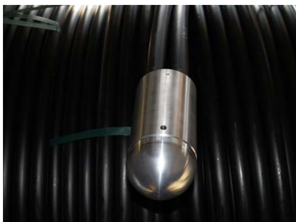
32 - safety probe foot® (Ø 95 mm)